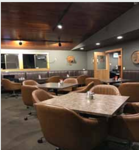
Pine Tree Dining Room

For take-out, please call your order in advance to (360) 221-8494 so it's hot, ready and waiting when you arrive to pick it up!